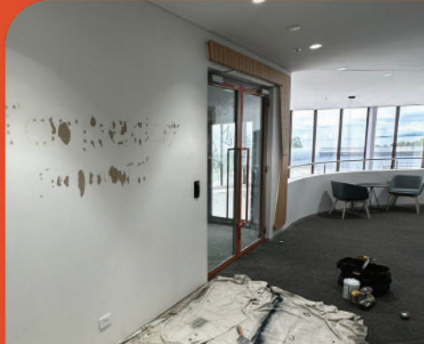
Removal of sign. Prep wall for plaster.