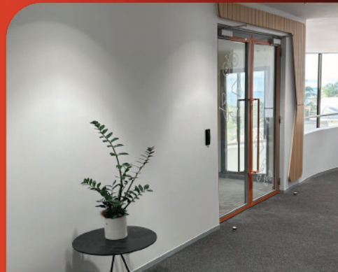
AFTER... Walls plastered and painted.