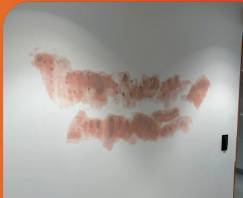
Plastering the GIB