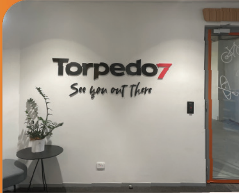
BEFORE... SIGNAGE REMOVAL